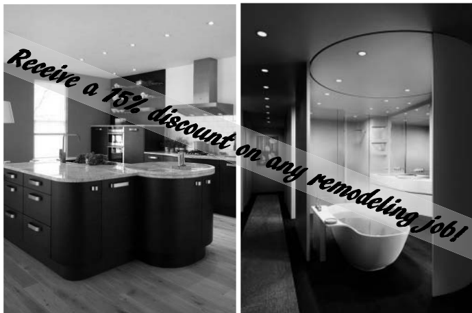
Painting & Services Unlimited Lic. CC94BS00437 • Lasora Enterprises, Inc CGC031497 Licensed & Insured General Contractor

10% OFF Any Service Valid With Coupon. Not To Be Combined With Other Offers. Exp 9/30/2012